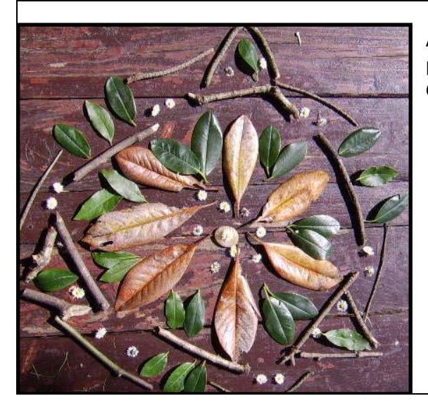
A collage made using daisies, leaves and twigs on a picnic bench by KS2 children at Luxulyan School, Cornwall.