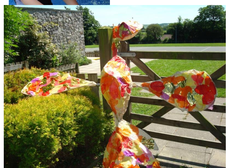
A finished phoenix decorated with metallic and coloured tissue paper.

Laying pva covered tissue paper over the withy frame.